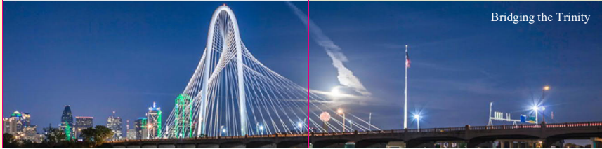
Bridging the Trinity