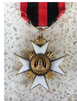
Knight's cross of the Order of St. Sylvester (1841)