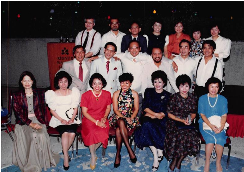
CLASS 1967 MEMBERS ATTENDING THE AWARDS CEREMONY